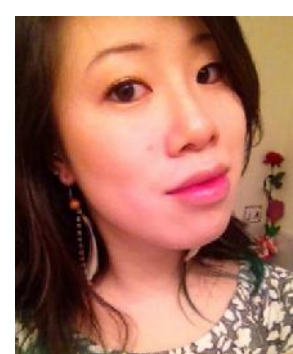
Allison Lau Schools