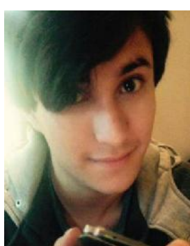
Conor Wilman Communications